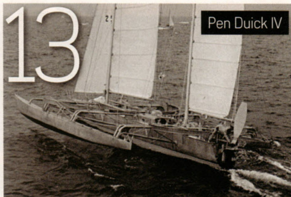
Pen Duick IV